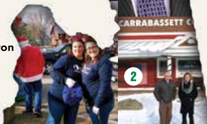
Farmington Holiday Parade