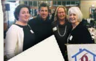
Sugarloaf Annual Charity Summit