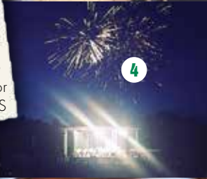
4 Kingfield POPS Proud annual sponsor of the Kingfield POPS